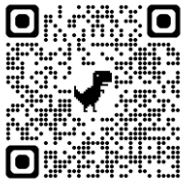
Place Value Basketball