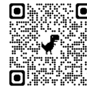
Planet Pals Pattern

Scan the QR code using a camera to play games which will help practise our learning in class.